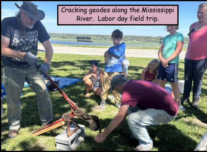
Cracking geodes along the Mississippi River. Labor day field trip.