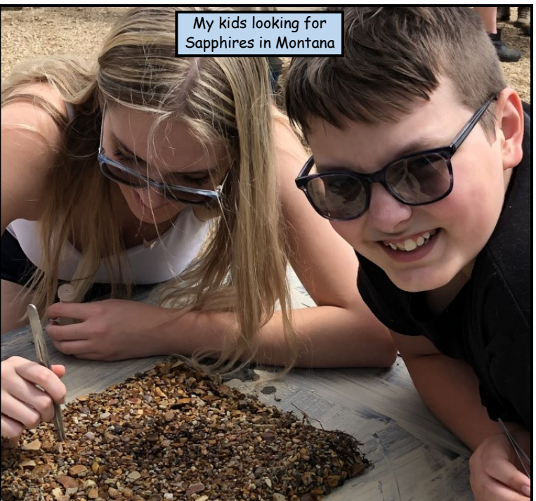
My kids looking for Sapphires in Montana